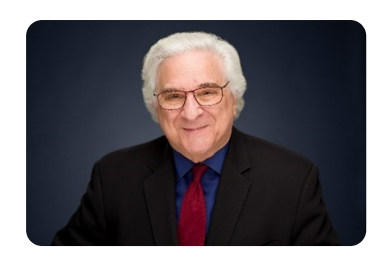
TODAY'S LECTURE Murry Sidlin, The Defiant Requiem November 8 1:30-2:30 PM In-Person at OLLI

the lecture starts to guarantee your seat. In-person fall lectures will be held at OLLI: 4801 Massachusetts Ave. NW, in Room A on the first floor.