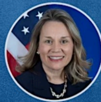
Ambassador Julianne Smith Former U.S. Permanent Representative to NATO (2021-2024) National Security Expert on U.S.-European Defense Policy & Transatlantic Relations