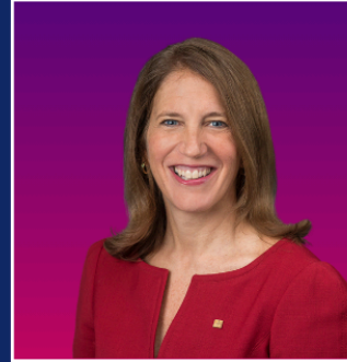
Hon. Sylvia BURWELL