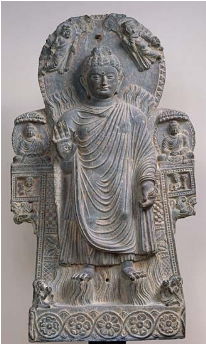
Sravasti: site of the twin miracles of flames and water