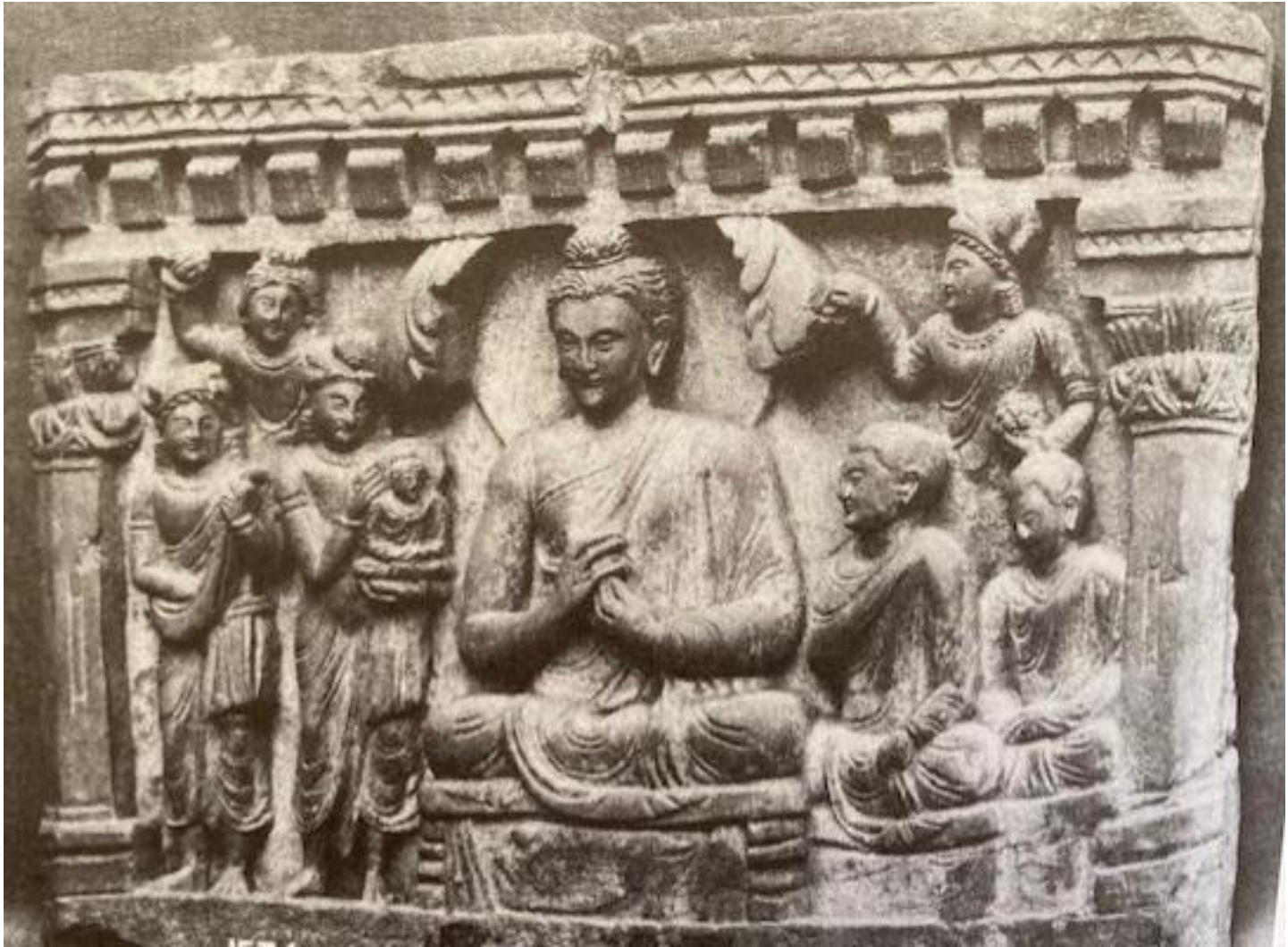
King Udayana presenting the Buddha image to the Buddha 3 rd c ad, Gandhara Peshawar Museum