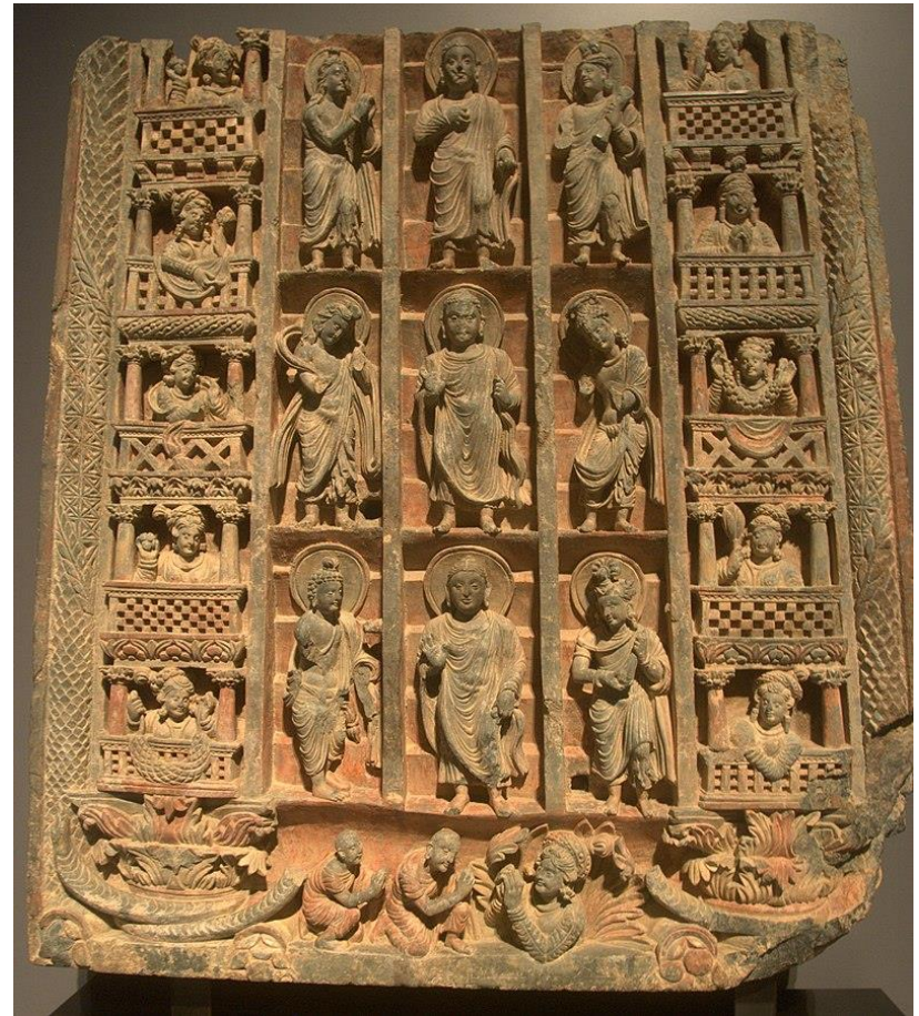
Sankasya: site of the descent of the Buddha from Triyastimsa heaven