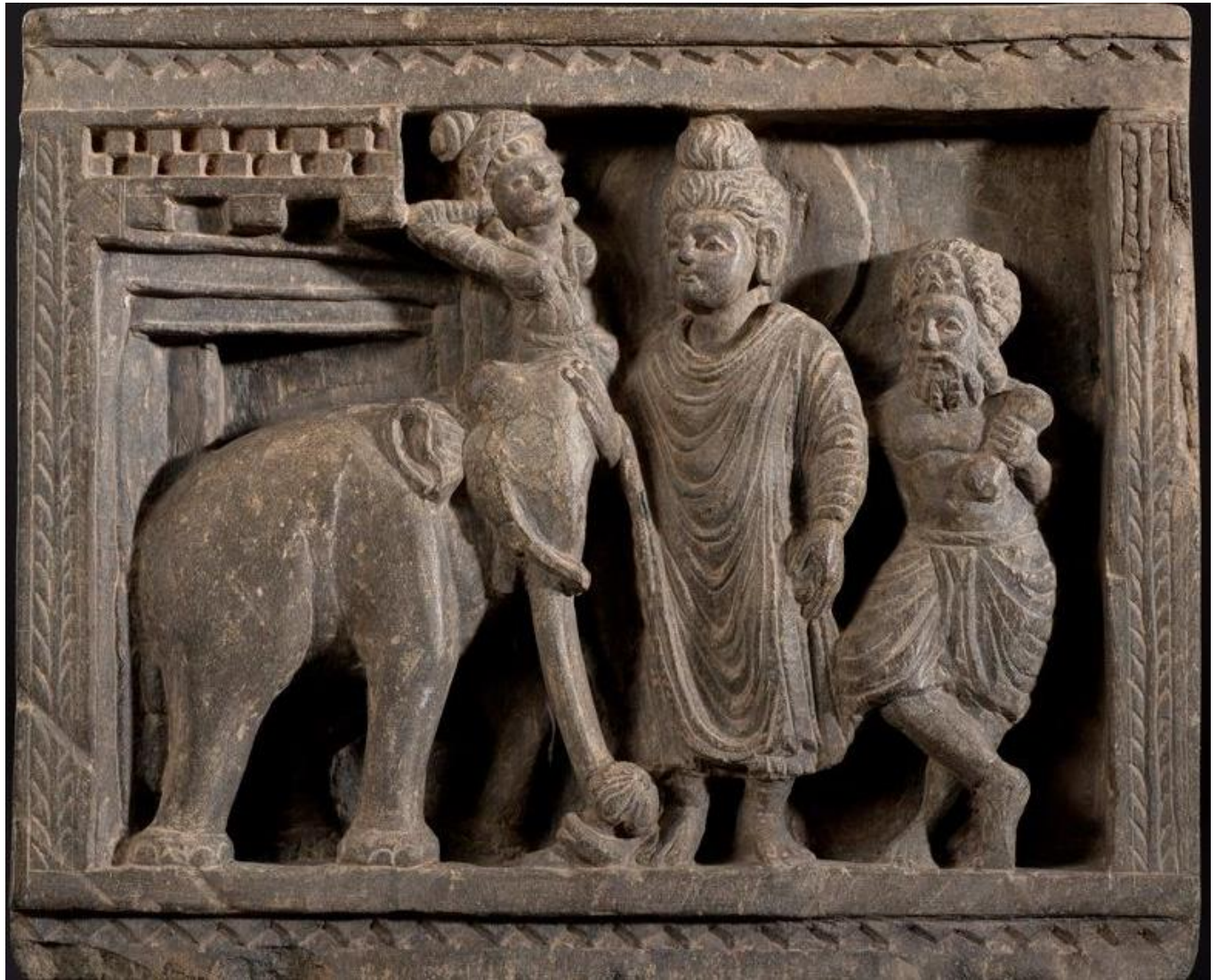
The Buddha calms the elephant Nalagiri