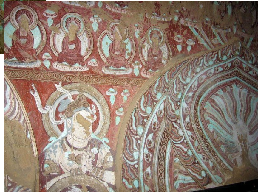
Caves at Bezeklik