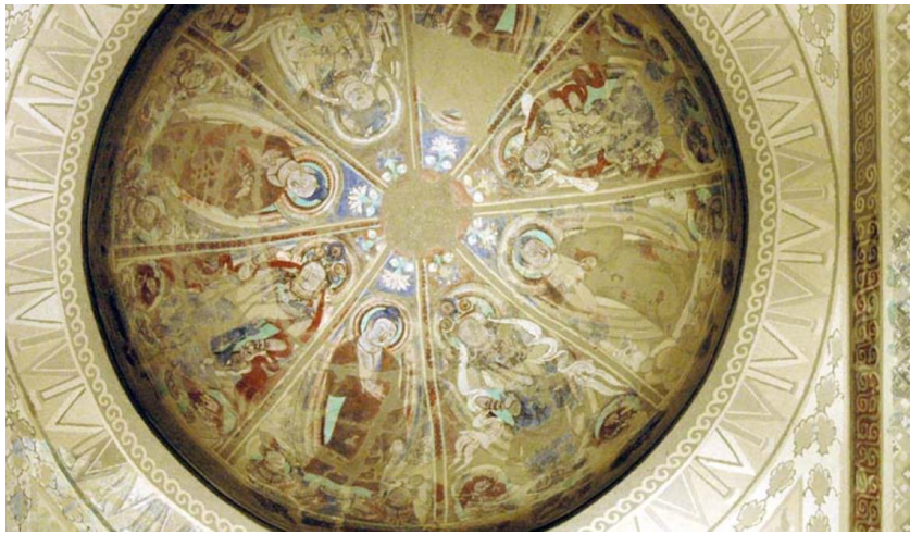
Kizil Cave 123 Reproduction