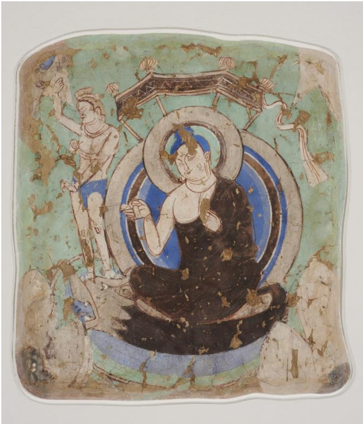
The Buddha preaching