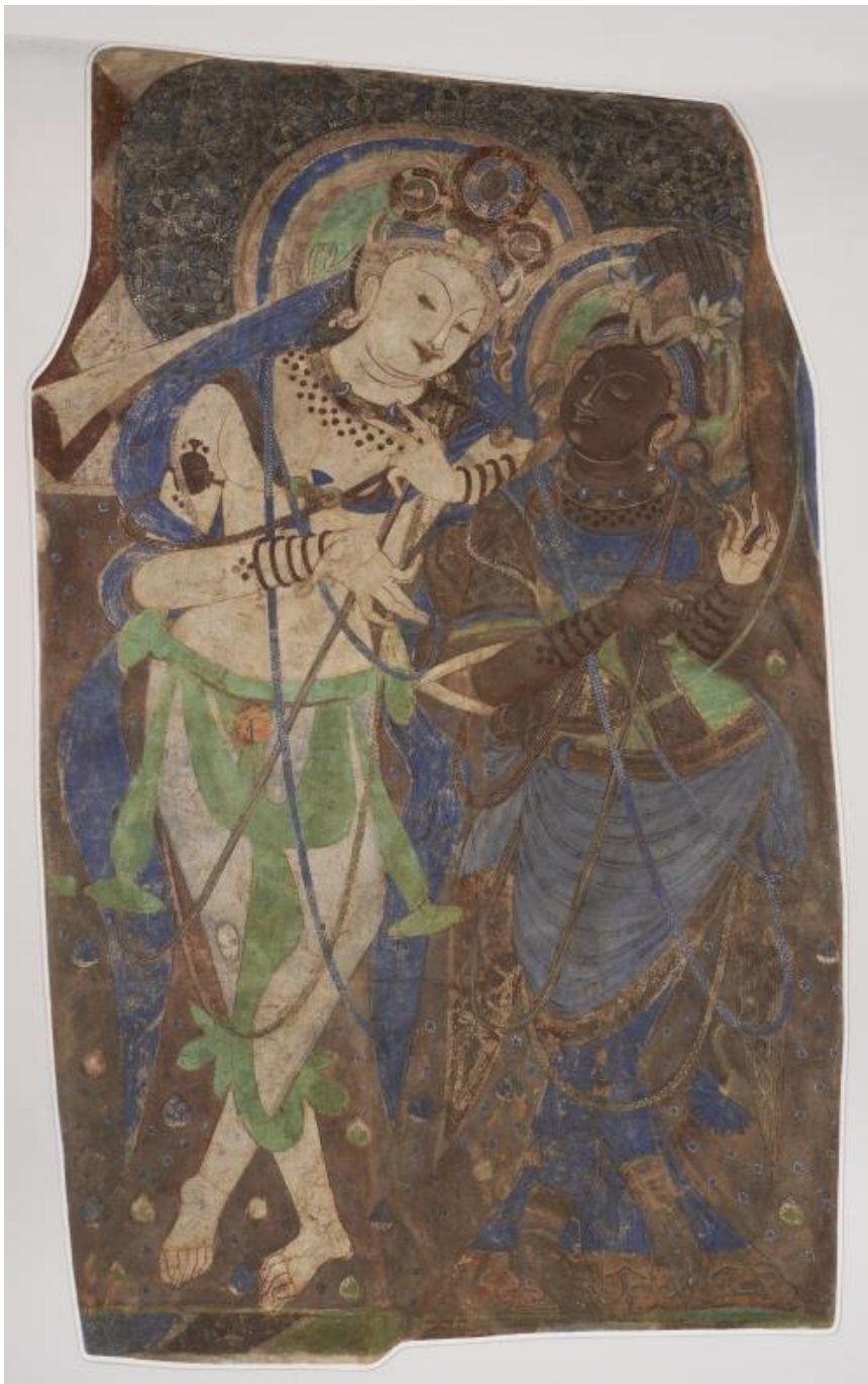
Bodhisattvas Cave 171, early 5 th c MIK, Berlin