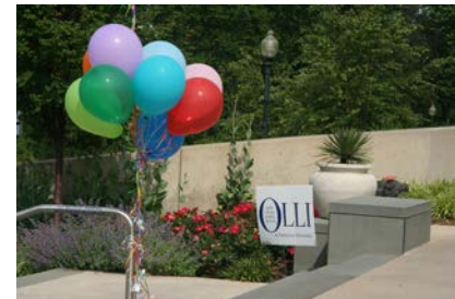
Outside the Katzen Center