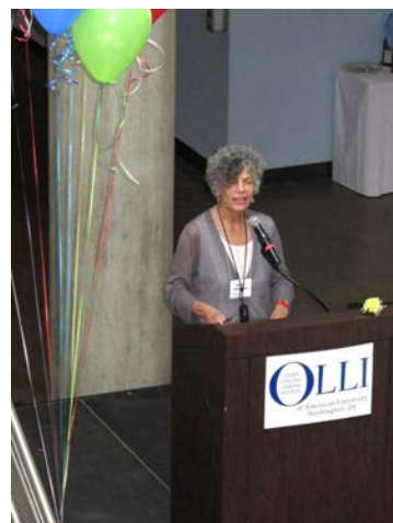
Speaker, Susan Stamberg