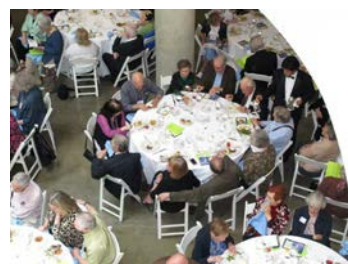
View from Overhead