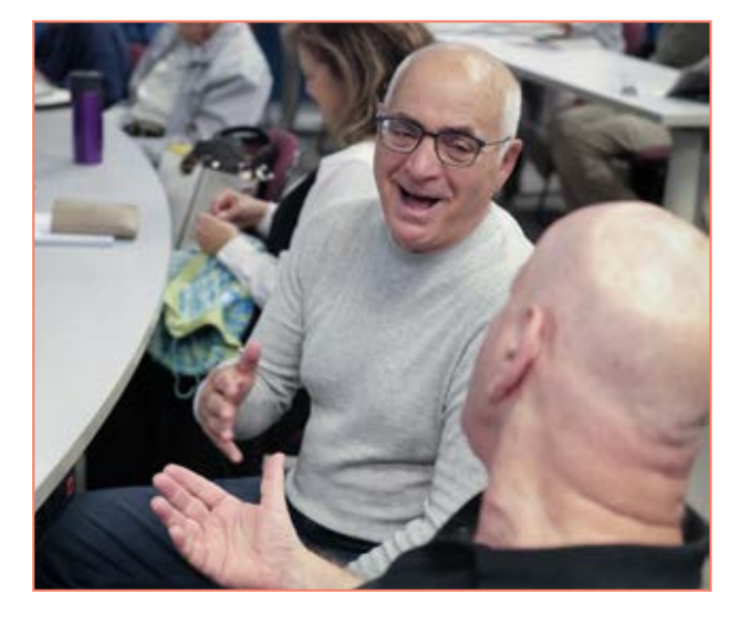
Thanks so much for the clear instructions and suggestions. And, of course, for all the work you are doing to keep OLLI moving forward during these very hard times.

I'm brand new to OLLI, just signed up for my first two classes this term, and am so impressed with your organization." ??